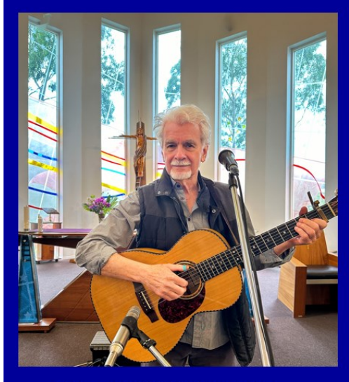
Composer of 'Fill My House', 'The Beatitudes, Where is your Song, my Lord?